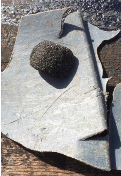
Reimagining the discarded: All Hallow's Eve mask

I was going to attend the ball of ghosts and witches. A delegation would appear there in masks and wigs, And dance, unrecognized, in the chorus of the living. - Czeslaw Milosz, All Hallow's Eve