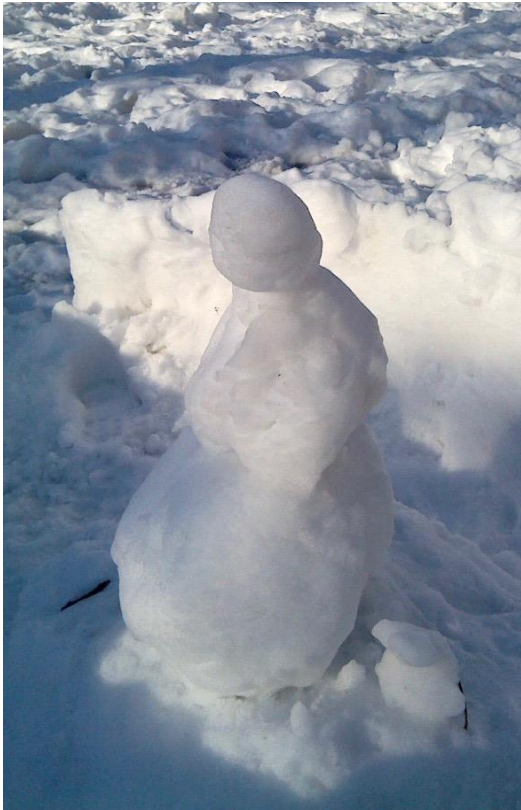
Madonna in Riverside Park, NYC After the big snowstorm in January 2016

I must be Mary and myself give birth to God, would I possess – nor can I otherwise – God's gift of everlasting happiness. - Angelus Silesius